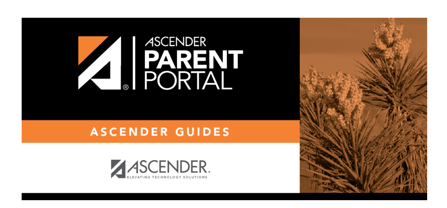
Admin - Form Field Management